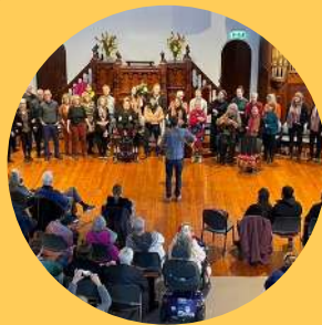
MELBOURNE MASS GOSPEL CHOIR