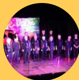
NORTH CARLTON RAILWAY HOUSE CHOIR